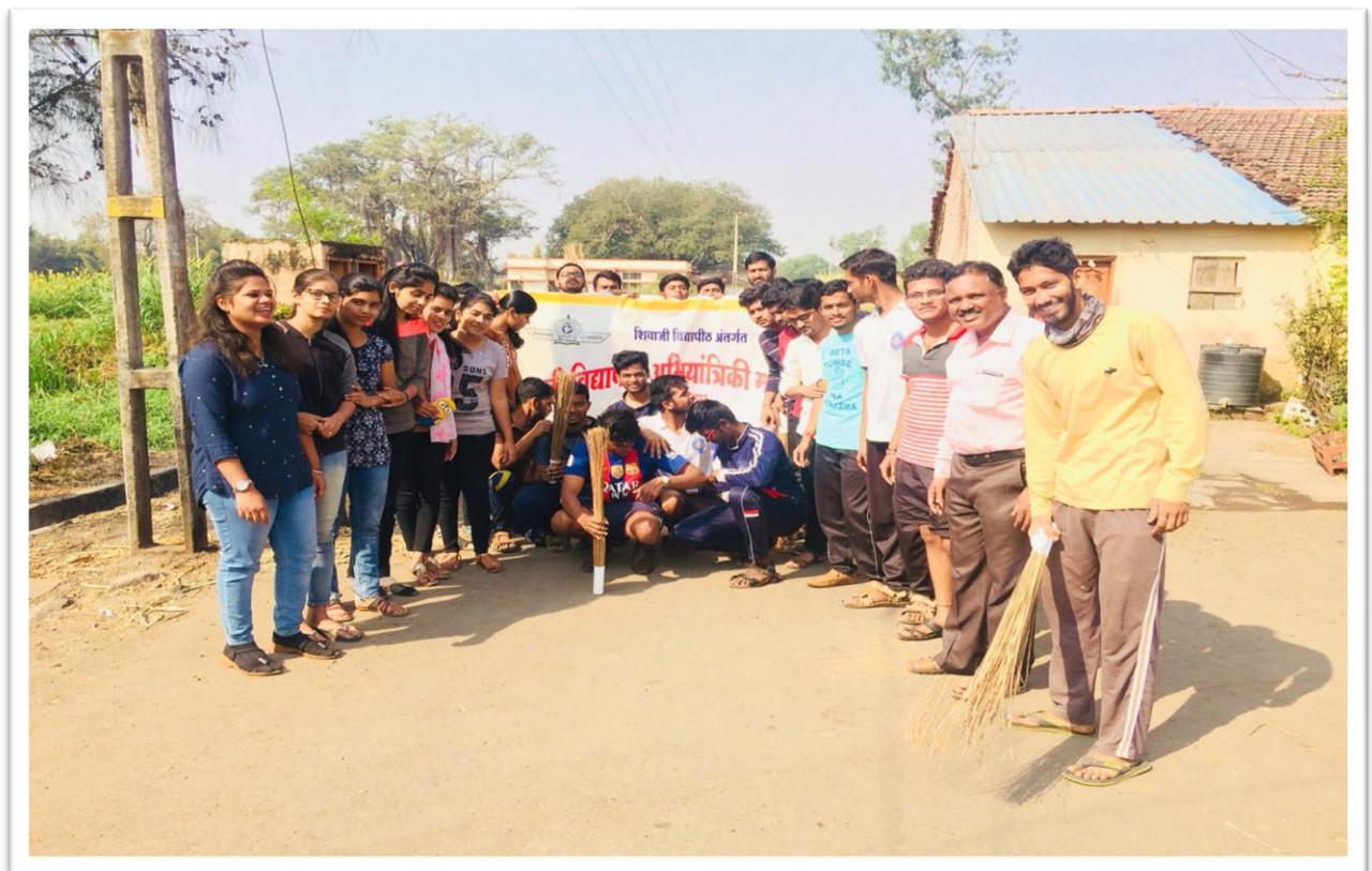
Participated NSS Volunteers.