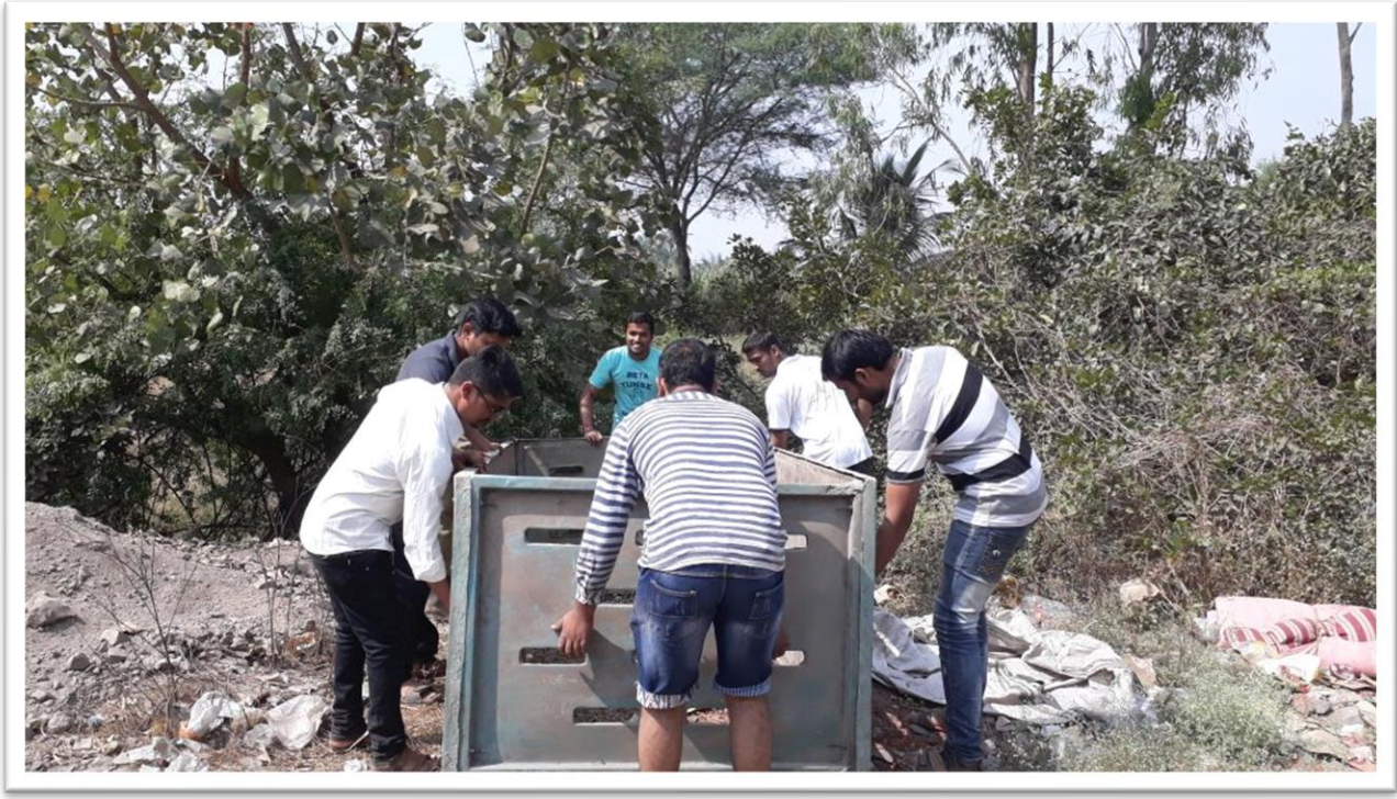
NSS. Volunteers from (Mechanical Branch)-Assembling & Fitting Box (Fiber Material) For Dumping Waste from Village.