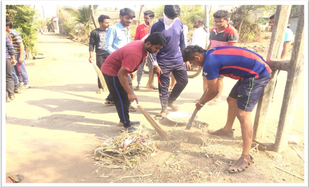
Working Group of NSS Volunteers.