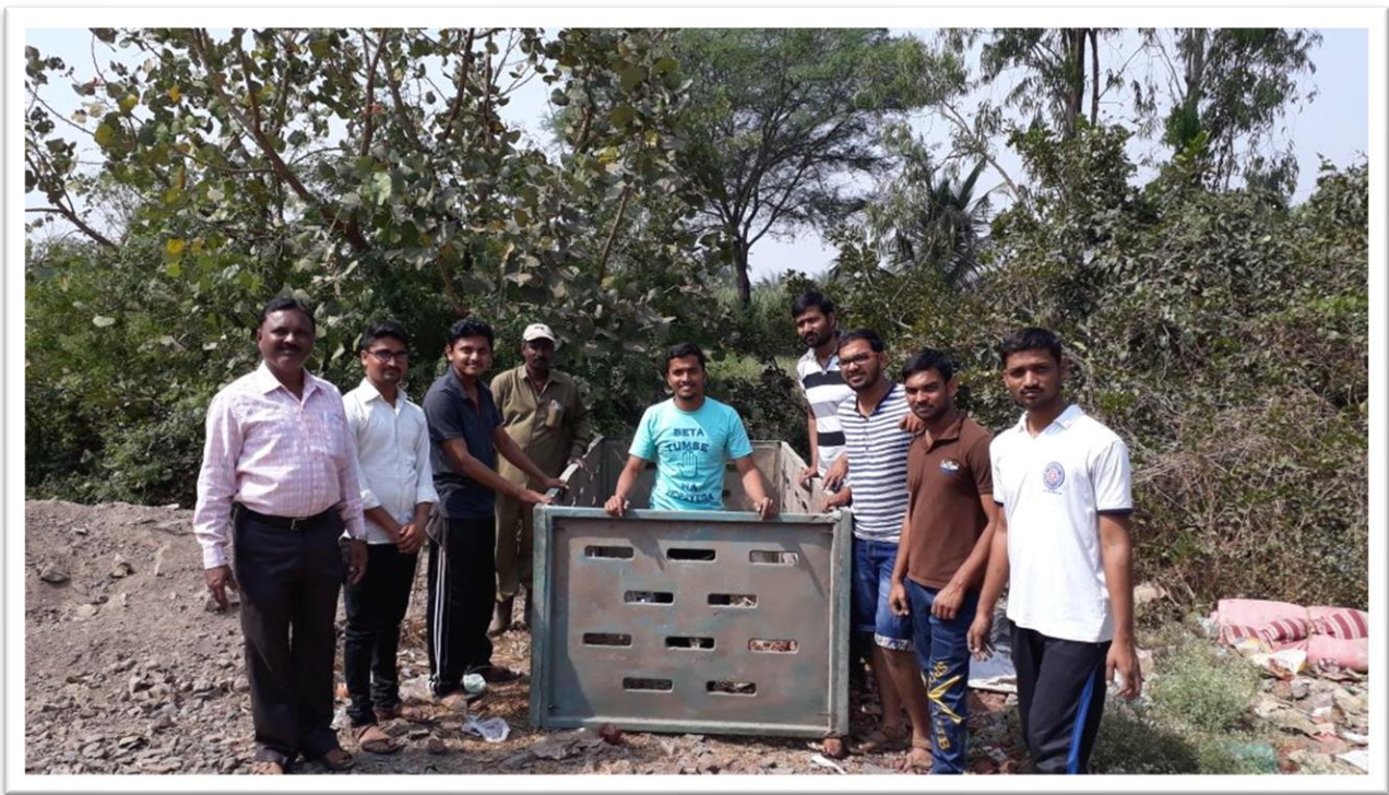
Assembly Complete-NSS Volunteers